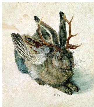
This picture is not the Easter Egg